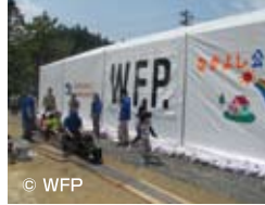
A temporary shopping arcade in Yamada Town, Iwate Prefecture

WFP's large tents were used for many purposes other than as warehouses: a temporary area for shops, temporary shelters from bad weather and meeting places for volunteers, areas for cleaning and displaying mementos found from rubbles, etc.