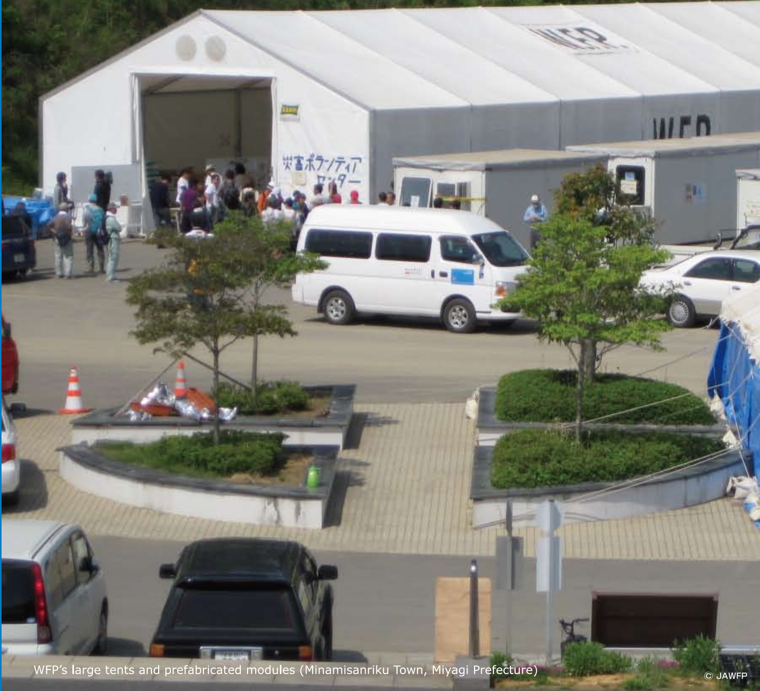
WFP's large tents and prefabricated modules (Minamisanriku Town, Miyagi Prefecture)

World Food Programme (WFP) / Japan Association for WFP (JAWFP)