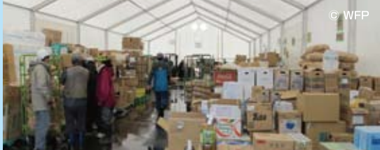
A large tent used by NGOs (Ishinomaki City, Miyagi Prefecture)

Regarding installation sites, please refer to the map below.